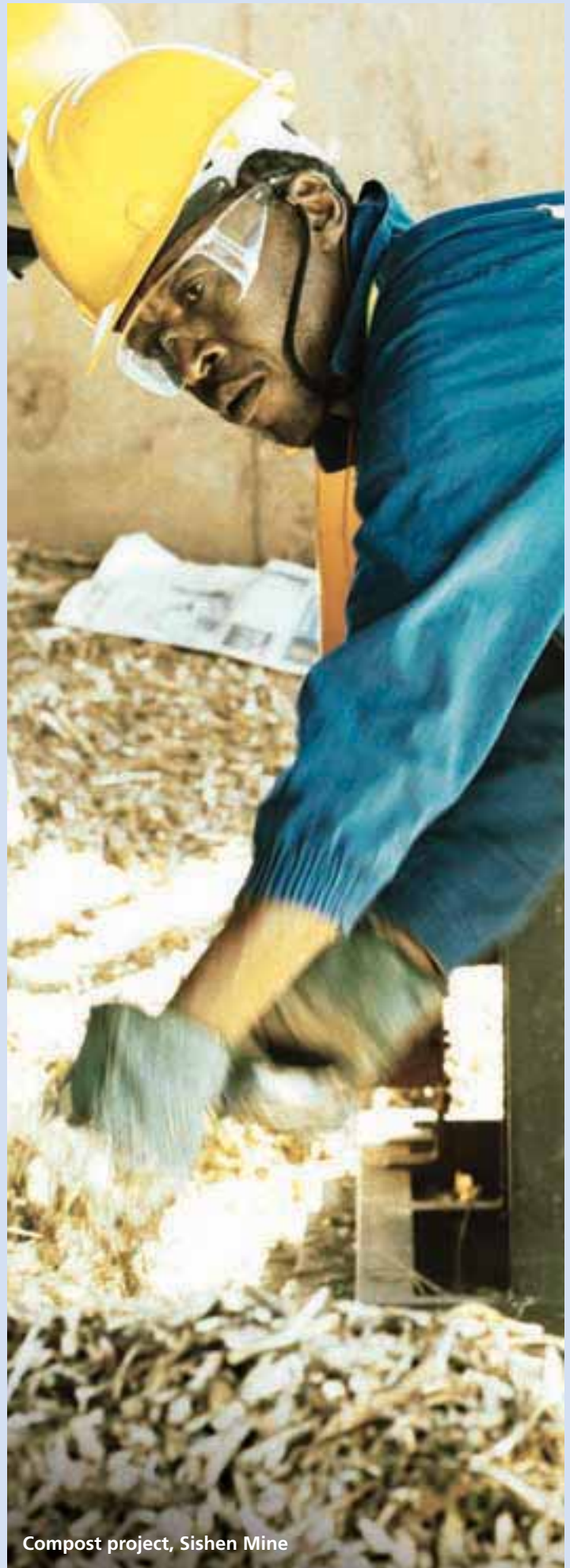
Compost project, Sishen Mine

Since the project started, many tonnes of compost have been produced by the six people employed and the first load of compost was sold to the mine in December 2007.